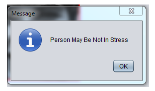
Fig. 6 Stress Detection