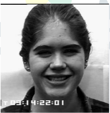
Fig. 2 Gray Image