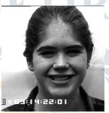
Fig. 1 Input Face Image

Let us consider the face image in figure 1. Gray scale conversion is completed which is shown in figure 2 and Median filtering is implemented on the acquired images to get rid of the unwanted noises. The outcomes are displayed in the figure 3 respectively.