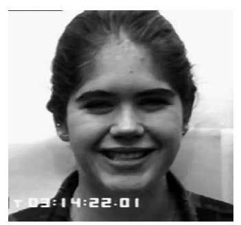
Fig. 3 Noise Removed Image