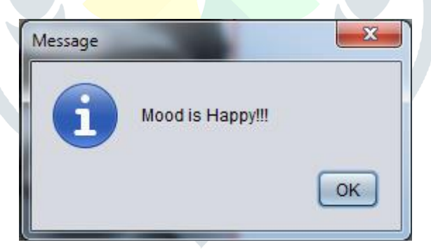
Fig. 5 Mood Detection

Next, image feature extraction process, all features are extracted from image and using that feature and also training data features to recognized the mood of person.