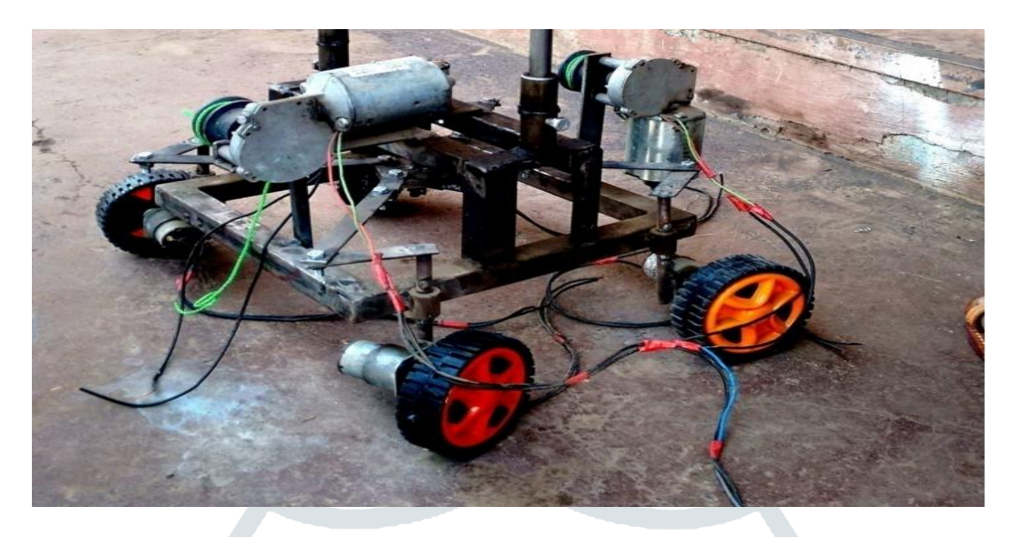
Fig.1. Implemented Lower Part