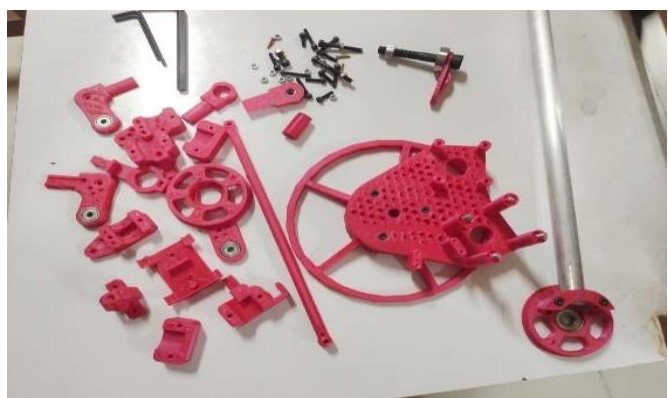
Fig.1. DRAW-BOT Model