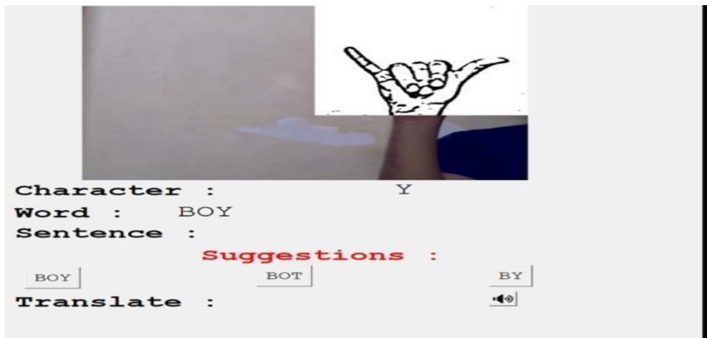
Fig. 8.1 Training and Testing Outputs

Above image show the capturing row image, gray scale image and image post gaussian for training and testing the dataset.